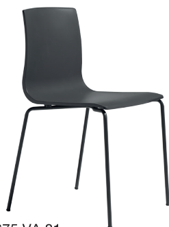
2675 VA 81

Scocca in tecnopolimero riciclabile. Struttura a 4 gambe in tubo d'acciaio ø mm 16 zincato e verniciato per uso interno ed esterno. Impilabile.