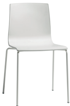
2675 VL 11