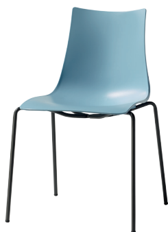
2615 VA 62

Scocca in tecnopolimero riciclabile. Struttura a 4 gambe in tubo d'acciaio ø mm 16 zincato e verniciato per uso interno ed esterno. Impilabile.