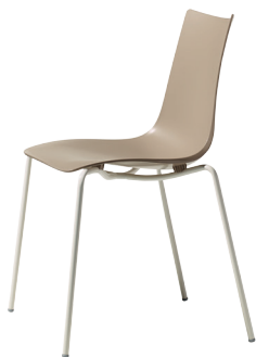
2615 VL 15